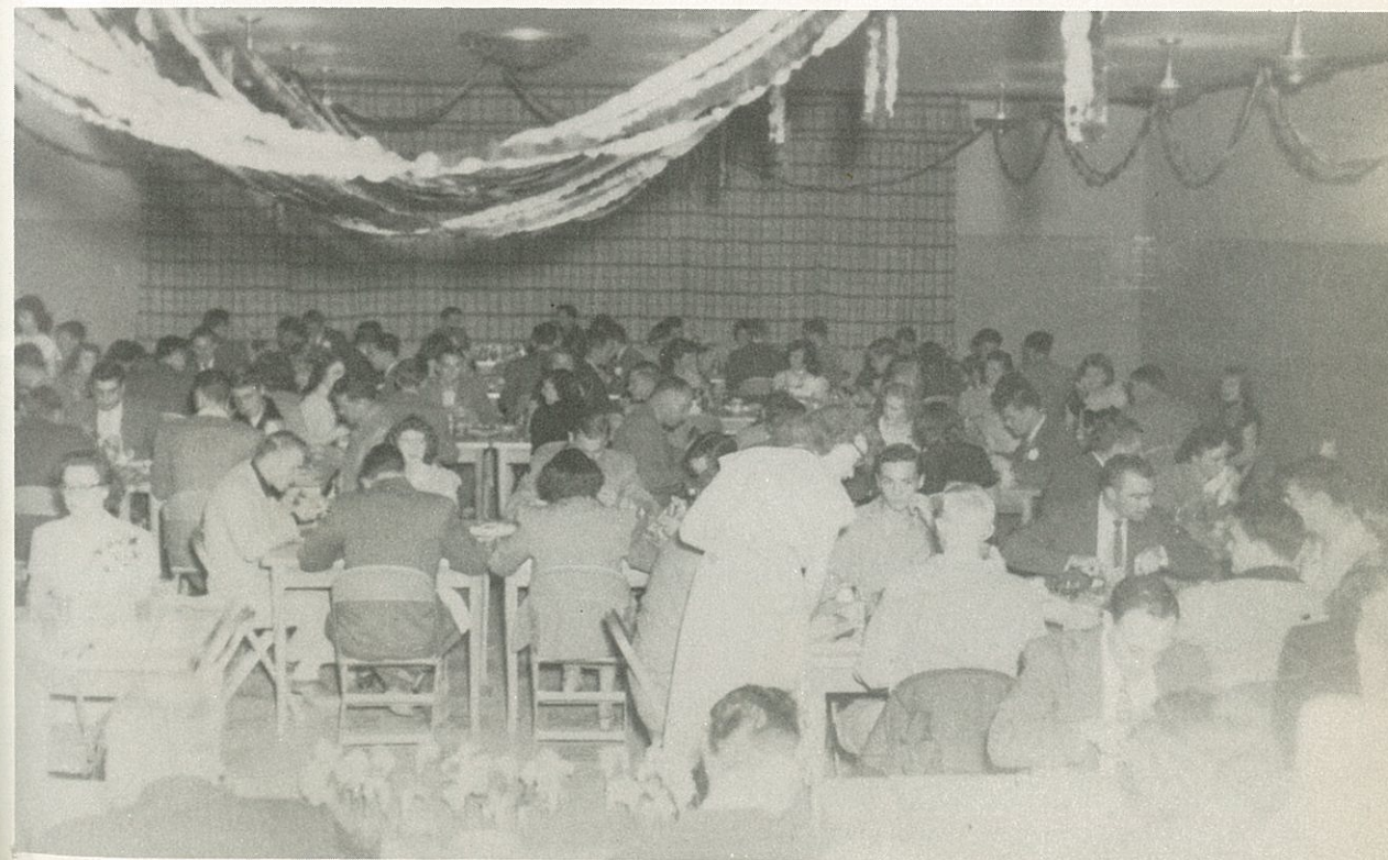
YELLOW JACKETS AND ALL DISTRICT TEAM HONORED BY SENIORS